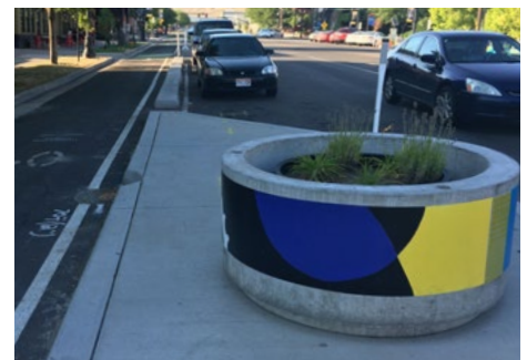
Similar ring and public art at SLC's protected intersection