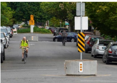
Traffic calming rings in Portland, OR

Traffic calming rings may be used where other traffic calming strategies like curb extensions or mini traffic circles are not feasible