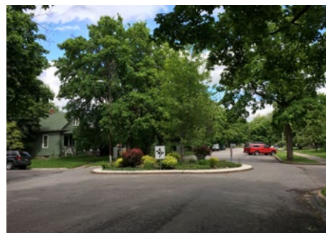
Example of an oval traffic circle at the intersection of 4th + Hazel St in Missoula, MT