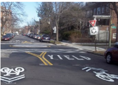
Yield signage at mini traffic circle in Baltimore, MD

Raised island design can vary and may include mountable curbs or aprons, signage, or landscaping. Any design elements included in the traffic circle (plants, public art, etc.) should consider and limit impacts to visibility from all directions