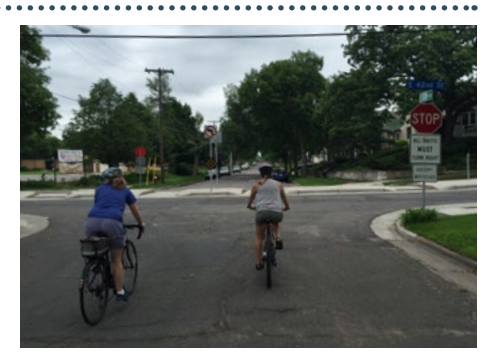
Full median refuge with closure in Minneapolis (17th Ave & 42nd St)