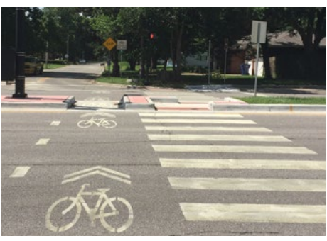
Median refuge with crosswalks in Wichita, KS