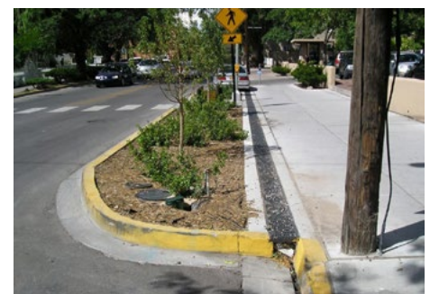
Curb extension with chase cover