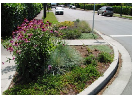
Landscaped curb extension

Curb bulouts create more space for landscaping, streetscape amenities, and bike ramps