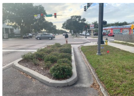
Floating curb extension in St. Petersburg, FL